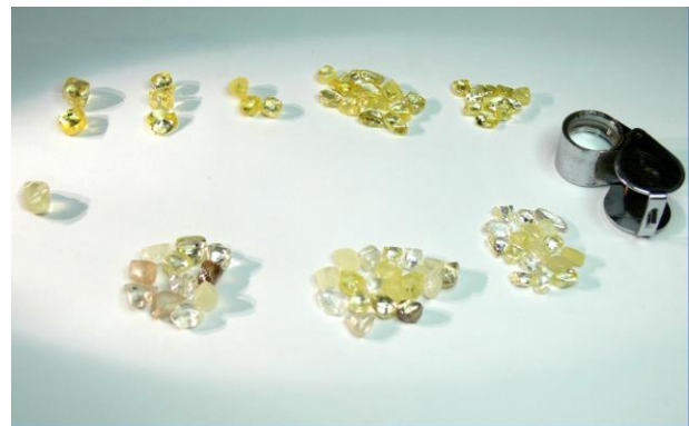
Some of the diamonds recovered from the Terrace 5 trial mining in 2005, largest stone 8.4 carats.