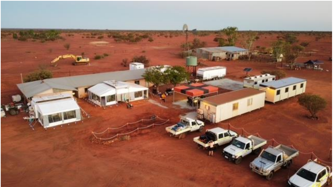
Figure 3: Completed camp setup for Yandal and Earahedy projects

The Company looks forward to providing further updates to the market as its various exploration programs progresses.