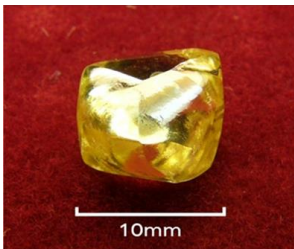
8.43 carat Fancy Yellow diamond previously recovered from GIB's Blina Diamond Project area.

GIB is pursuing a program of systematic bulk sampling of these prospective gravel targets to define the extent and grade of the diamondiferous gravels, which will lead into trial mining of the best grades.