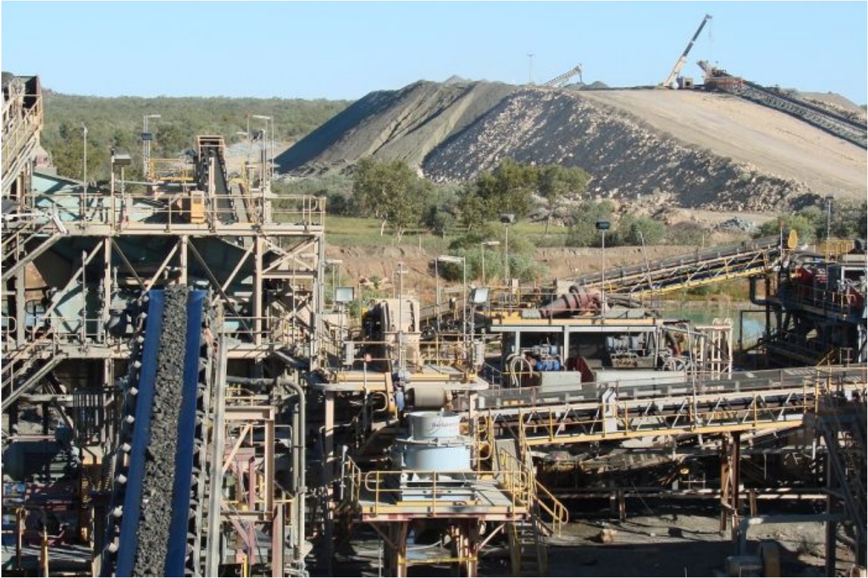
The Kimberley Diamond Company's Ellendale diamond mine went into administration in 2015.