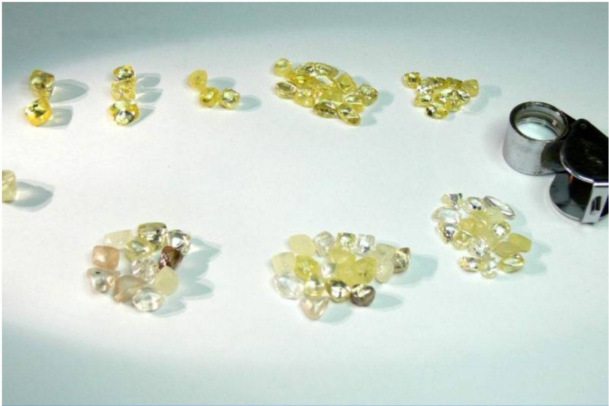
Some of the diamonds recovered from the Terrace 5 trial mining in 2005, with the largest stone measuring 8.4 carats.