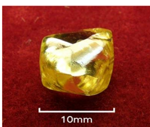
8.43 carat Fancy Yellow diamond previously recovered from GIB's Blina Diamond Project area.

GIB is pursuing a program of systematic bulk sampling of these prospective gravel targets to define the extent and grade of the diamondiferous gravels, which will lead into trial mining of the best grades.